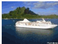
The Secret to Getting Highly Discounted Cruise Tickets

Do we need the changes that are being proposed? Absolutely not.