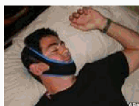
Are You Snoring Yourself To Death?

As an employee benefits broker and a member of the New Jersey Association of Health Underwriters, I am acutely aware of the weaknesses and the strengths in our health care system. I have not read or heard anything in the proposed plans that address significant cost drivers like fraud and tort reform. Nor have I seen anything about administrative cost accountability.