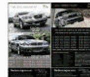
Madison Jaguar MADISON, NJ